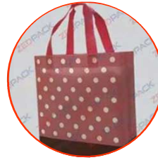
Printed Non Woven Reusable Bags