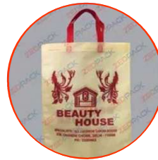
Non Woven Fabric Loop Handle Bag