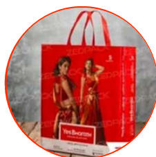
Metalised Non Woven Shopping Bag