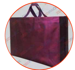
Bopp Laminated Bag