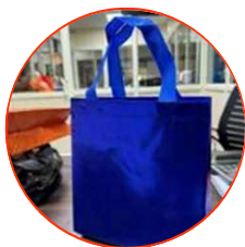
Non Woven Bag