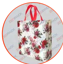
Printed Shopping Bags