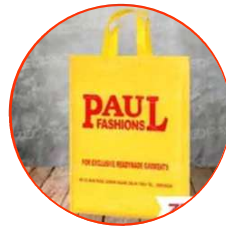
Laminated Non Woven Loop Handle Bag