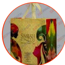
Printed Shopping Bag