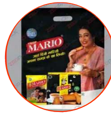
Brand Promotion Non Woven Bags