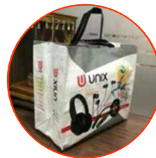
Bopp Laminated Pp Woven Bags