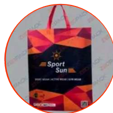
BOPP Laminated Loop Handle Bag