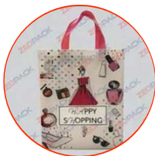
Non Woven Shopping Bag