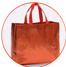
Printed Non Woven Loop Handle Box Bag