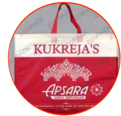
Laminated Non Woven Shopping Bag