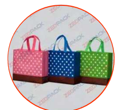
Reusable Non Woven Bags