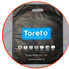
Brand Promotion Non Woven Bags