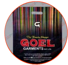
Printed D Cut Bags