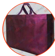
BOPP Laminated Non Woven Bag