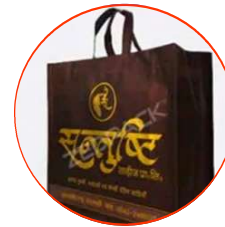
Non Woven Stitched Bags