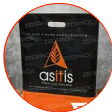
BOPP Laminated D Cut Bags