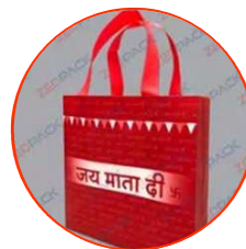
Devotional Non Woven Bags