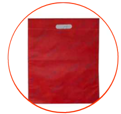
Laminated Non Woven D Cut Bag