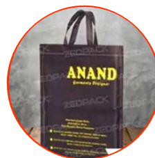
Printed Non Woven Loop Handle Bag