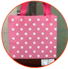
Printed Non Woven Bags