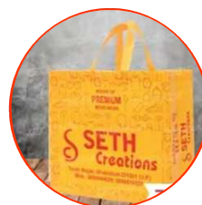
Metalized Loop Handle Non Woven Bags