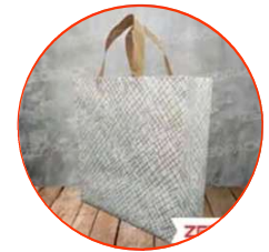
Non Woven Box Type Bag