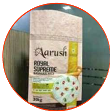
Bopp Laminated Pp Woven Rice Bags