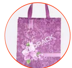
Promotional Non Woven Shopping Bag