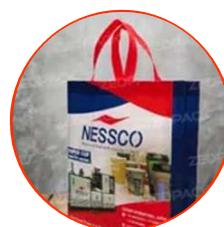
BOPP Laminated Reusable Bag