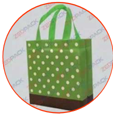
Non Woven Laminated Bags