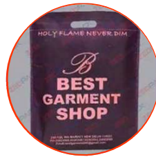
Printed Non Woven D-Cut Bag