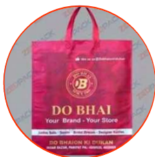
BOPP Laminated Loop Handle Bag