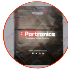
Printed Non Woven D Cut Bags