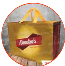
Loop Handle Sweet Carry Bags