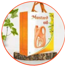
BOPP Laminated D Cut Bag