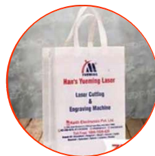
Promotional Carry Bag