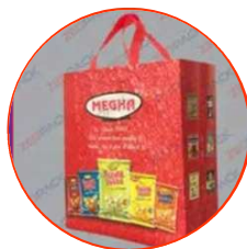
Recyclable Carry Bag