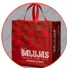
Non Woven Bag