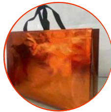
Designer Shopping Bag