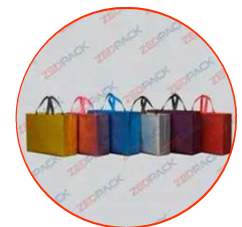
Red Metallized Non Woven Bags