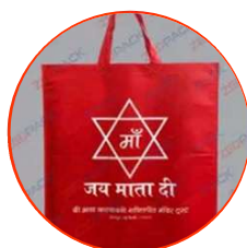
Devotional Non Woven Loop Handle Bag