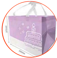
Cake Carry Bag