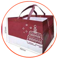
Cake Carry Bag