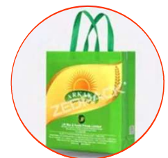
Non Woven Loop Handle Bags