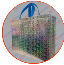
Non Woven Box Bag