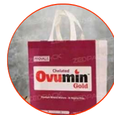
BOPP Laminated Non Woven Bags