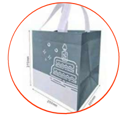
Cake Box Bag