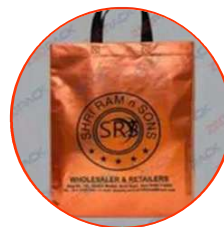
Metalized Loop Handle Non Woven Bags