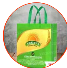
Loop Handle Promotion Non Woven Bag