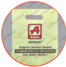
Non Woven Fabric D-Cut Bag