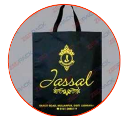
Non Woven Loop Handle Bag for Garments