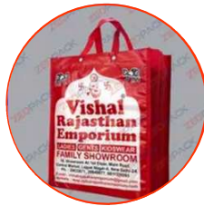
Non Woven Stitched Bag