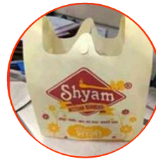
Non Woven Box Bag