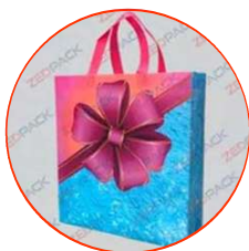
Designer Gifting Bags