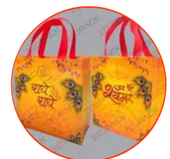
Red Metallized Non Woven Bags