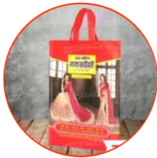
BOPP Laminated Shopping Bag