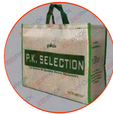
Non Woven Stitched Bag