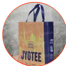
Promotion Non Woven Bags