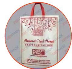
Flexo Printed Carry Bag