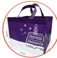
Cake Box Bag