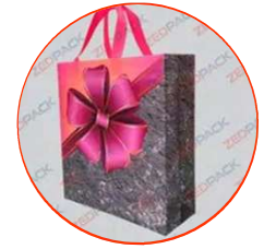
BOPP Laminated Non Woven Bag