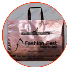
Metalised Non Woven Shopping Bag